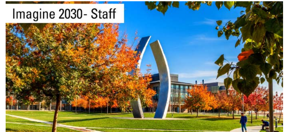
Imagine 2030- Staff